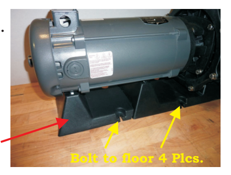
2 HP Support

14. For the 2 HP motors an additional support is required. This support is not attached to the other support and should be bolted down to the floor along with the standard base. (See yellow arrows.)