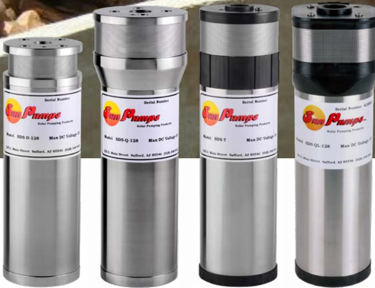
SDS-D 316 Stainless